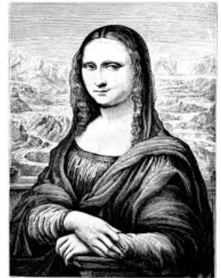
Mona Lisa (Leonardo da Vinci)

I am an artist; my tool is a brush and I view the world in an artistic way. For example, the Mona Lisa, it is a magnificent work of art painted by a master artist. It must be kept in a museum for safe keeping. The temperature, humidity and even the lighting must be controlled. And because it is so precious it is guarded 24/7.