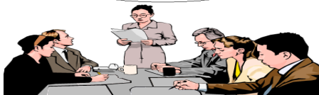
AA. Holiday Meeting ALKATHON

4. Find out about the special holiday parties, meetings, or other celebrations given by groups in your area, and go. If you're timid, take someone newer than you are.