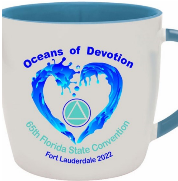
65th Florida State Convention 8/3-7, 2022 Harbor Beach Marriott, Ft Lauderdale 65.floridastateconvention.com

Our NEFL area is in need of any information on new or revised Spanish meetings. Also we are looking for Spanish speaking members that would be willing to take AA informational phone calls for Spanish questions. Please call the IG office at 399-8535 to assist us in helping others. THANK YOU GRACIAS! Se habla español