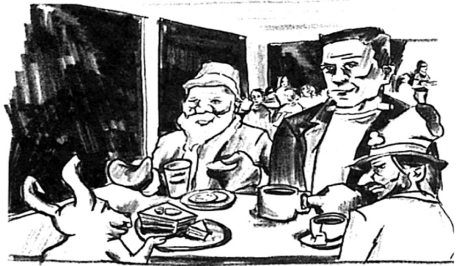
"We are people who normally would not mix."